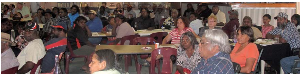
A recent health regional summit, hosted by AMSANT, held in Alice Springs.