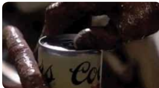
Coors in E.T. (1982)