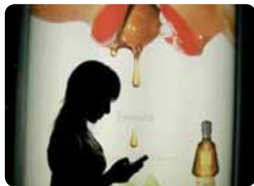
Outdoor alcohol advertisement at tram stop in Fitzroy, Melbourne

Alcohol advertising often features sexualised and suggestive imagery, gender stereotypes, and content that links drinking with sexual prowess and success. Adolescents tend to be highly tuned to the gendered and sexualised imagery that pervades advertising (Borlagdan et al. 2010; Jones & Reid 2010). Some researchers have argued that for young people who are developing their sense of self and understanding of relationships, the persistent use of sexualised imagery and stereotypes normalises drinking as an essential component of sexual interactions (Jones & Reid 2010).