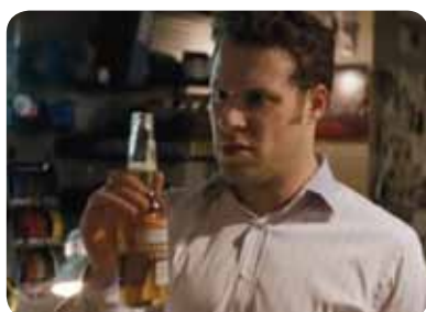
Corona in The Green Hornet (2011)