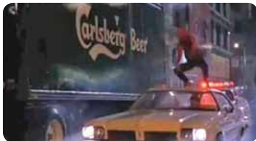
Carlsberg Beer in Spiderman (2002)