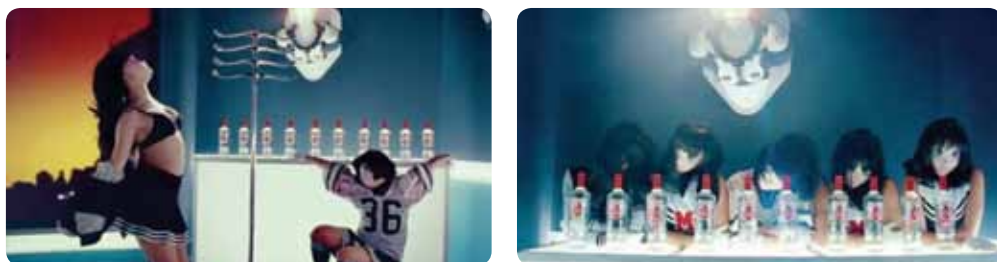
Give Me All Your Luvin' Madonna (2012)

Madonna is another high-profile singer who is popular among teenage girls and, as brand ambassador for Smirnoff Vodka, is an enthusiastic promoter of vodka-based beverages. In an extended bar scene in the music video clip for Give Me All Your Luvin' (2012), Madonna and other female models are shown dancing around a bar displaying a row of ten illuminated Smirnoff Vodka bottles. The release of this music clip coincides with a wider marketing campaign between Madonna and Smirnoff Vodka, which includes a global Facebook competition dubbed the 'Smirnoff Nightlife Exchange Project Dance Competition'.