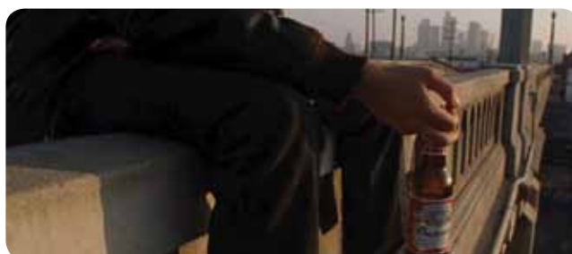
Budweiser in Terminator 3: Rise of the Machines (2003)

Within the alcohol industry, one of the most effective exponents of product placement has been the US company Anheuser-Busch. Anheuser-Busch established its own placement firm in 1988, becoming the first company and the first brewery to do so. Analyses of US films have shown that Anheuser-Busch brands are the most frequently featured alcoholic beverages to feature in US films, with the brand Budweiser recording the most number of appearances. In addition to film, Anheuser-Busch have also incorporated their brands into television shows such as Survivor , Mad Men , True Blood , Entourage , Sons of Anarchy , Man of Your Dreams and Saturday Night Live . Heineken has also been active in this area in recent years, with paid placements in, and merchandising tie-ins with, Austin Powers and James Bond movies. Miller, Corona, Jack Daniel's, Johnnie Walker and Smirnoff are among the other most frequently featured brands in US films.