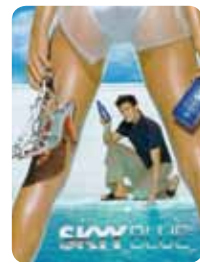
Skyy Blue advertisement

In addition to content analyses, research has found that adolescents and young people perceive alcohol advertising to be pitched towards them. A study undertaken by Jones and Donovan (2001) found that 25 per cent of 15 to 16 year olds thought advertisements for alcohol were aimed at their age group; 50 per cent of 19 to 21 year olds believed the same ads were targeting people younger than them.