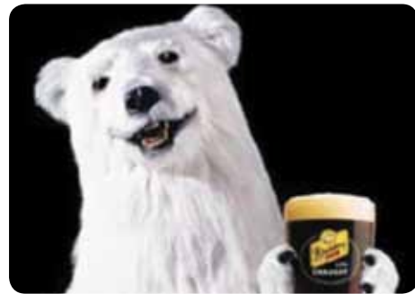
Studies have indicated that the 'Bundy Bear' that features in advertisements for Bundaberg Rum are widely recognised and liked among young Australians.