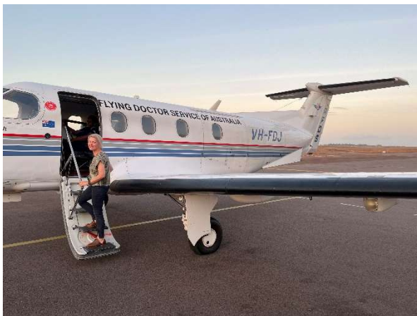
RFDS flight to Maningrida

Maningrida "the place where the Dreaming changed shape," Thankyou!