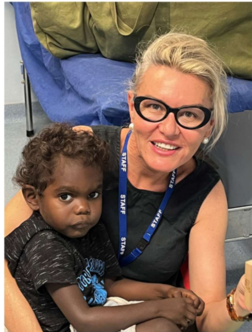
Childhood Health Clinic