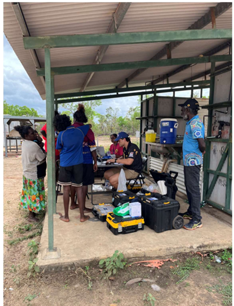
Buluh Kadura - Clinic