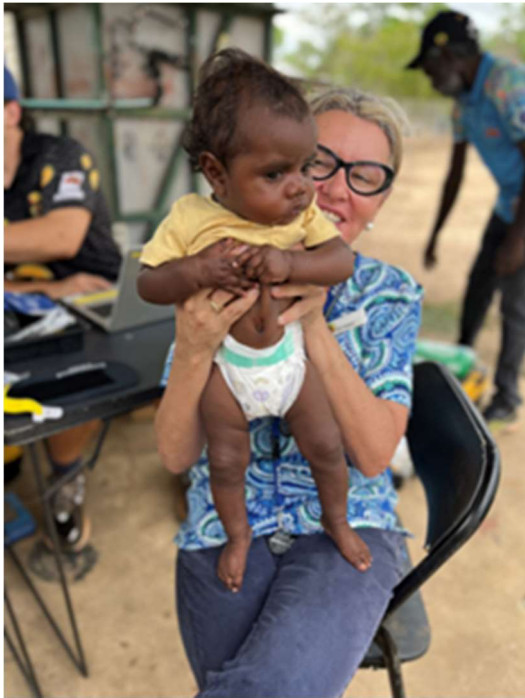
Buluh Kadura – outstation bubba and me