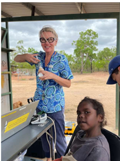
Buluh Kadura – Clinic mixing Abs