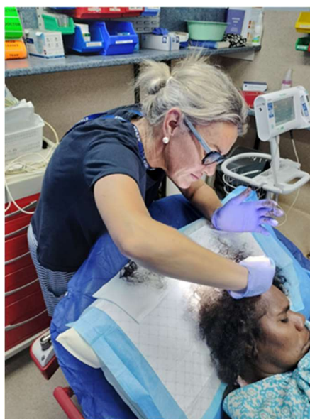
Hard at work suturing