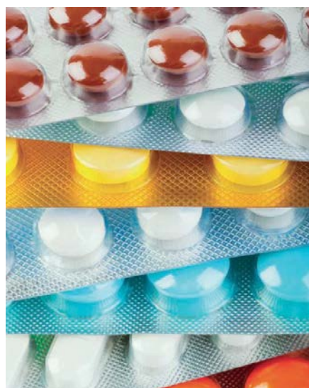
Stack of tablets in foil wrapping